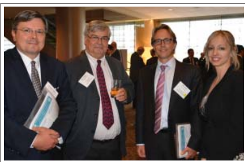
2015 ITA Workshop

“Fabulous conference. Far and away the most interesting arbitration conference I have ever attended.”