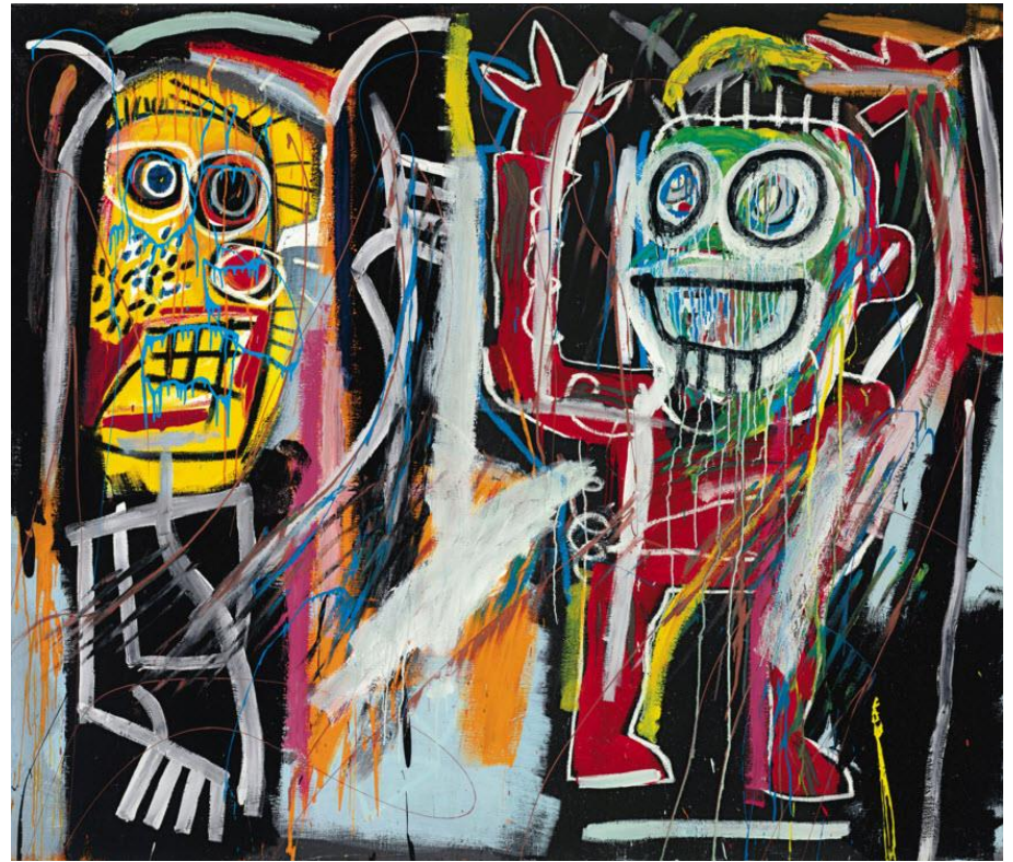
Dustheads , by Jean-Michel Basquiat