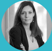
LAURENCE PONTY ARCHIPEL